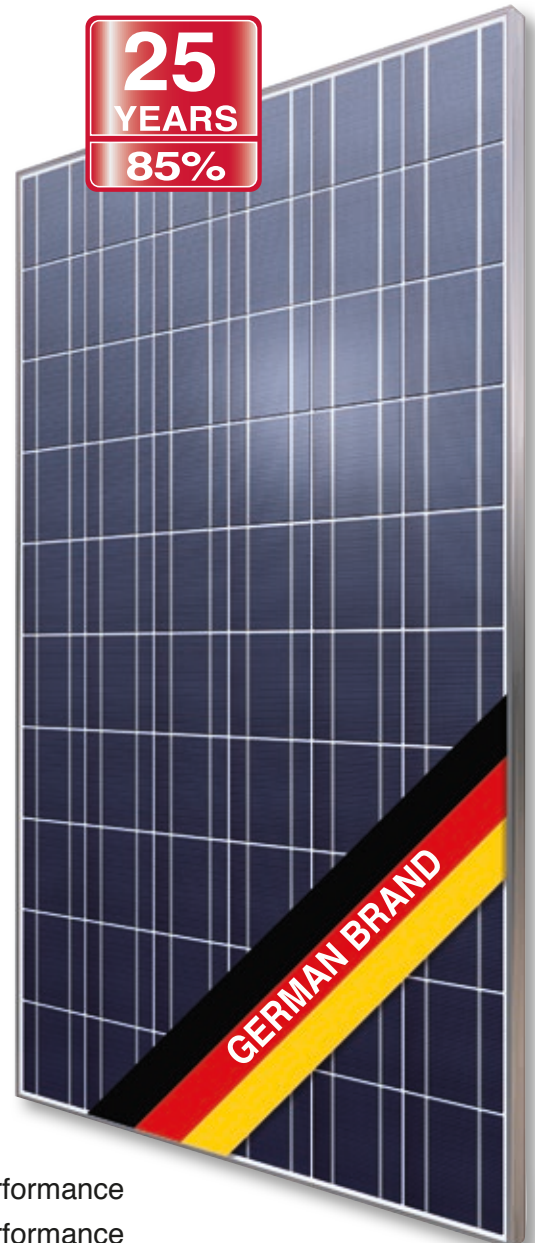
Fig. similar 60P156EN180321A

Exclusive linear AXITEC high performance guarantee!