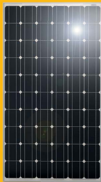
Monocrystalline module (detail view)