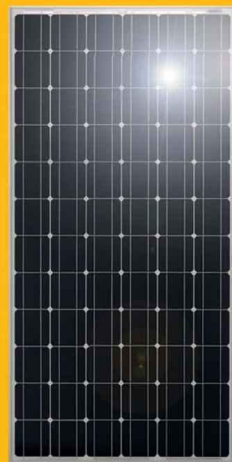
Monocrystalline module (detail view)